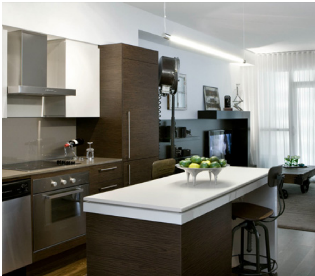
The kitchens feature CaesarStone countertops, back-painted glass backsplash and stainless steel appliances.

Nexterra plans to carve out a niche for modernist, eco-friendly homes and is also looking at building in Calgary, he says.