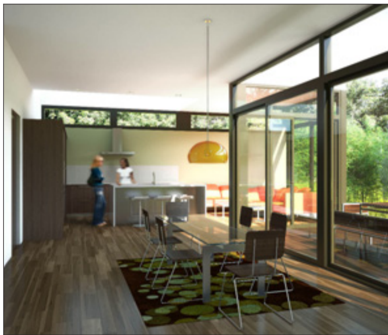
Triple glazed glass with argon gas will be used in the Canadian homes.

The idea, in other words, is for DNA to become a part of them.